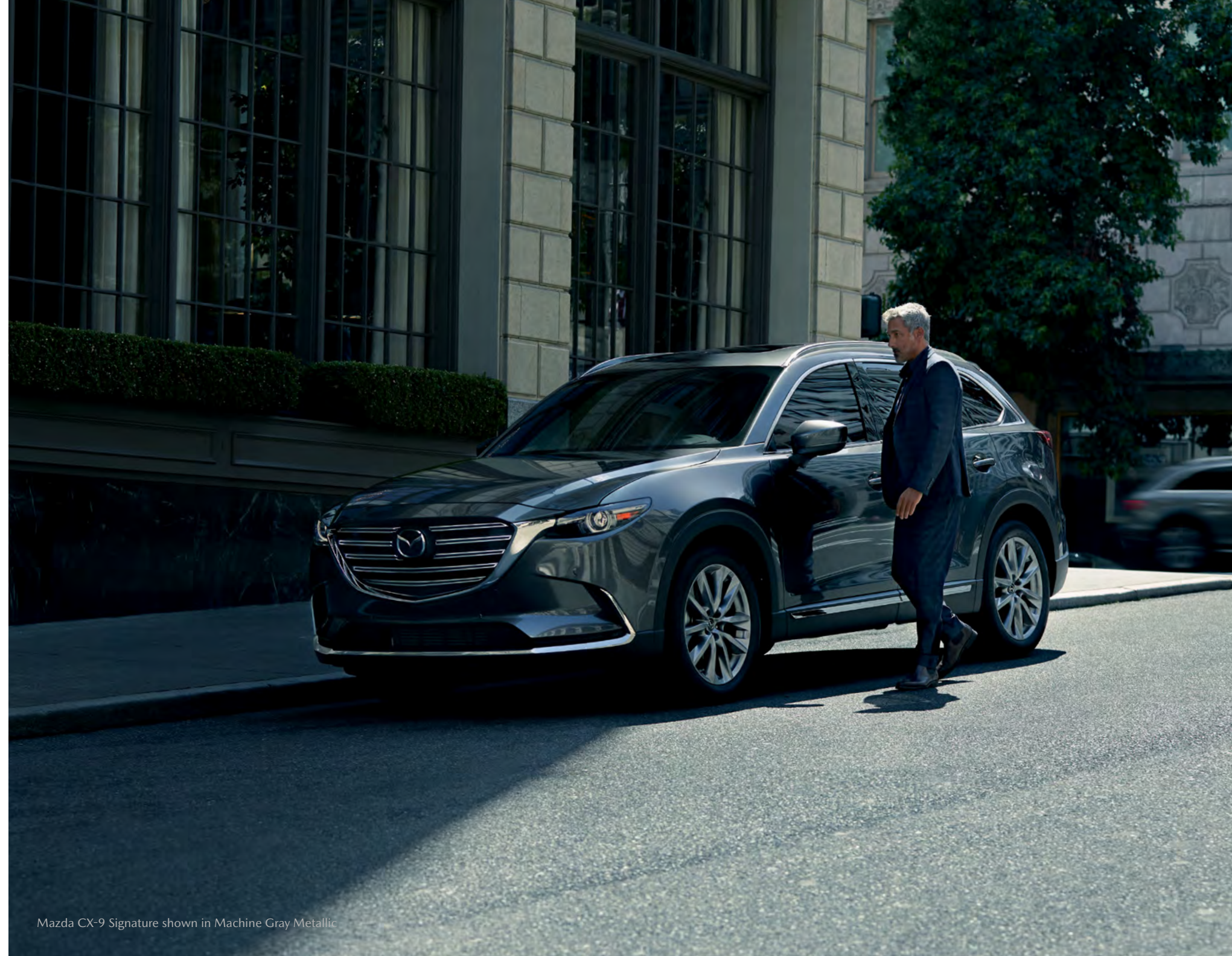
Mazda CX-9 Signature shown in Machine Gray Metallic