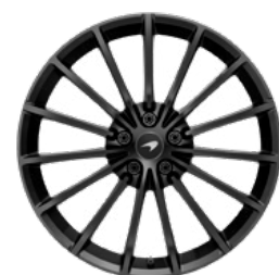
Gloss Black 3