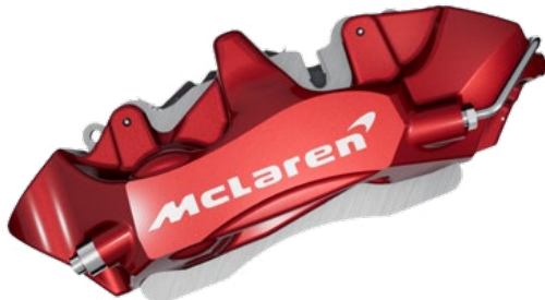
Red caliper Silver machined McLaren logo