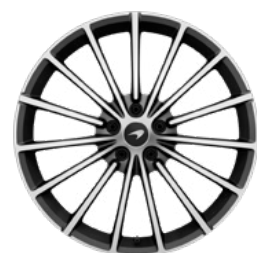
Gloss Black Diamond Cut 2