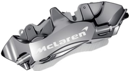
Polished caliper Silver machined McLaren logo