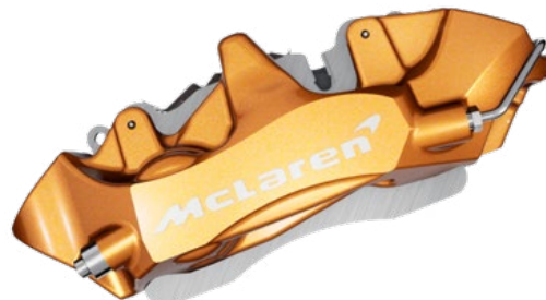
Azores caliper Silver machined McLaren logo