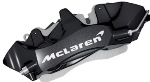
Black caliper White printed McLaren logo