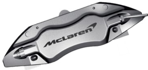
Polished caliper Black printed McLaren logo