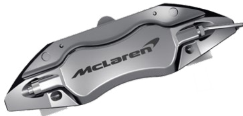
Silver caliper Black printed McLaren logo