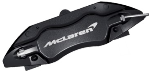
Black caliper Silver printed McLaren logo