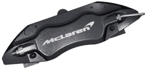
Gunmetal caliper Silver printed McLaren logo