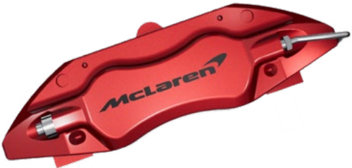
Red caliper Black printed McLaren logo